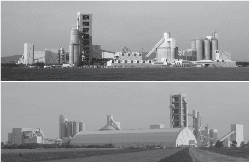
Figure 3-4 – Views of the cement factory in Királyegyháza as of 2012

From a visual point of view, the mine is a serious landscape scar which significantly reduces the aesthetic quality of the landscape in its closest environment. Moreover, the factory is an intense land shaping and land changing object with concrete towers emerging from the earlier more monotonic plain areas ( Figure 3-4 ).